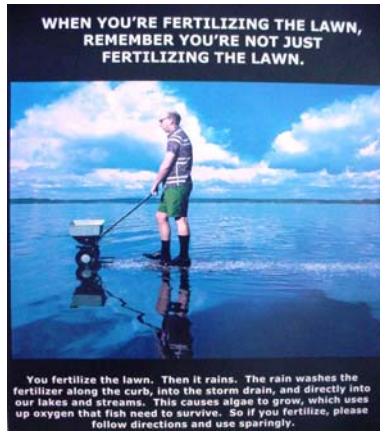
Water Quality Posters Educating the Public About Stormwater Runoff

The 10th Annual Adirondack Waterfest was held in its original birth place: Speculator. The Greater Adirondack Resource Conservation & Development Council (RC&D), Hamilton County Soil & Water Conservation Districts (SWCD) and several other organizations worked together to make the event a huge success. Next year's Adirondack Waterfest will be held in Gurney Lane, Queensbury on August 24th.