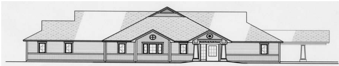
Proposed Health Care Facility in the Town of Moriah.

The US Department of Commerce—Economic Development Administration (EDA) has given preliminary approval for a $400,000 Public Works grant to help construct a new Health Care Facility in the Town of Moriah, Essex County. The new health care facility to be constructed in the Moriah Business Park, will offer comprehensive primary care services to residents in the Town of Moriah and adjacent Towns of North Hudson and Crown Point. This new health facility will replace one that the Town previously owned and operated through a wholly owned subsidiary. That facility, long in decline, was closed in late 2004 due to structural reasons. Health care is now being provided on a temporary basis in a Town-owned building under a new management arrangement with an experienced and successful primary care provider, the Hudson Headwaters Health Network (HHHN). HHHN provides comprehensive primary health care services including treatment of chronic, acute and emergency illness, and hands-on care in the office, nursing home, hospital and home settings. HHHN will also manage and operate the new health care facility which is scheduled to be operational by late 2006. Funding for the balance of the nearly $900,000 project has been secured thanks to the efforts of Congressman John McHugh, State Senator Betty Little and Assemblywoman Teresa Sayward.