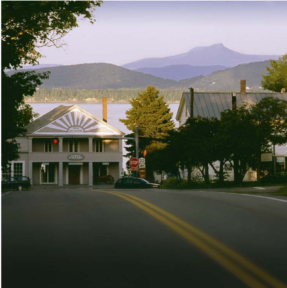
A VIEW OF LAKE CHAMPLAIN FROM THE HISTORIC HAMLET OF ESSEX