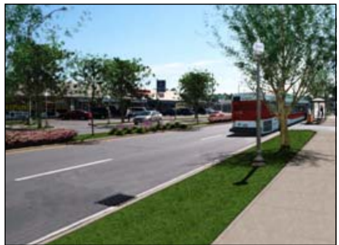
CONCEPTUAL ILLUSTRATION OF UPPER GLEN STREET IN QUEENSBURY

A/GFTC and its consultant team of Resource Systems Group and The Saratoga Associates, has completed a Regional Access Management Guidebook. The guidebook is designed as a reference for local municipalities to consult during the planning process when making decisions that affect land use and access to roadways. Four local corridors were selected for further study to show the many benefits of sound access management practices to the transportation system and the surrounding community. Pictured on the right is a conceptual illustration of Upper Glen Street in Queensbury with a center median, landscaping and transit amenities added.