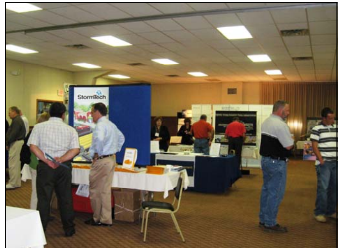
VENDORS AT THE TRADESHOW

Also through CWICNY, the Regional Planning Board was also able to organize several Onsite Wastewater Training events, including two separate three day trainings for local code enforcement officials and private professionals in the wastewater field. Approximately 70 people were certified in Soils Analysis, Installation and Inspection of Onsite Wastewater Treatment Systems.