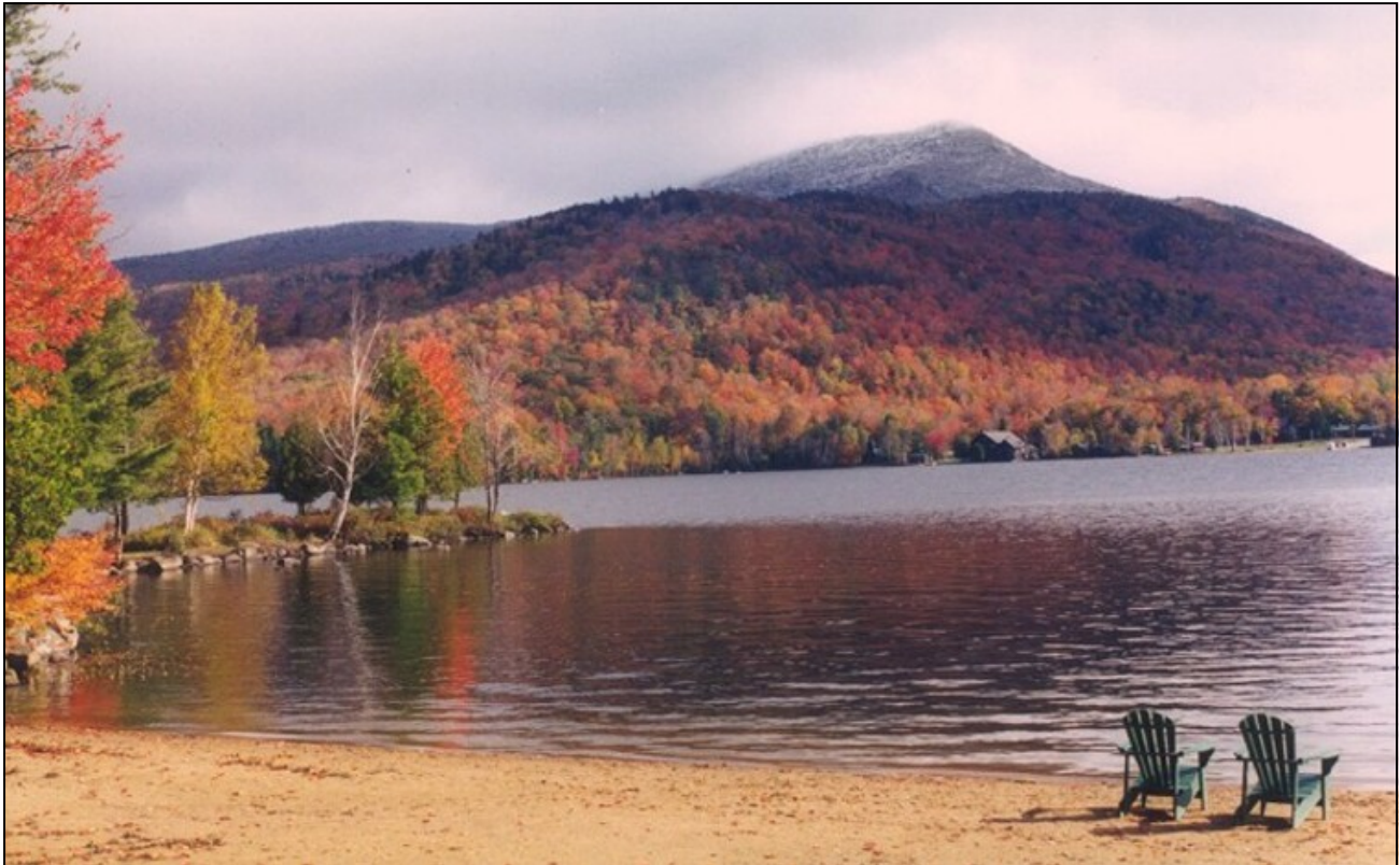
BLUE MOUNTAIN LAKE IN HAMILTON COUNTY