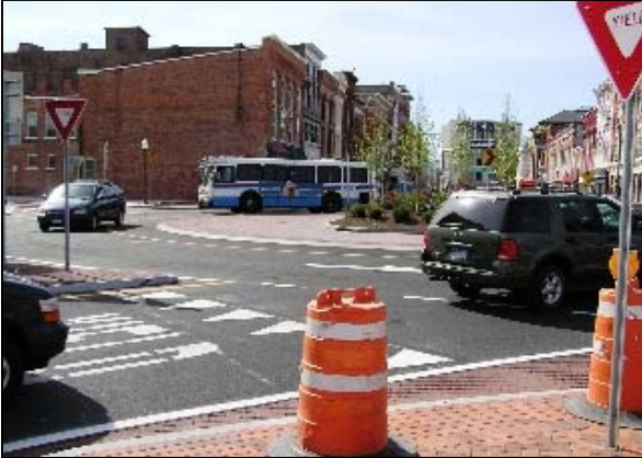
GLENS FALLS' CENTENNIAL CIRCLE

The SRTS program aims to encourage and enable children to walk and bicycle to school, and to make those modes more appealing and safe. This program is a federal-aid reimbursement program administered by the Federal Highway Administration and the New York State Department of Transportation. Qualifying applications within Warren and Washington Counties and the Town of Moreau will be prioritized by the A/GFTC. A workshop was hosted on December 11 th for potential applicants and sponsors from Warren, Washington, Essex, and northern Saratoga Counties.