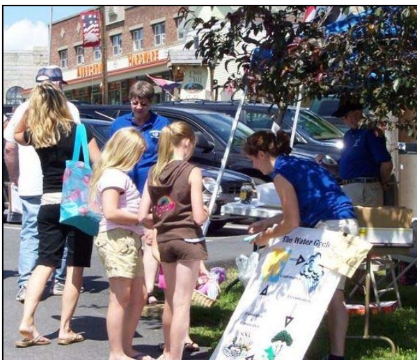
2007 ADIRONDACK WATERFEST

The 2007 Adirondack Waterfest was held Ticonderoga's Bicentennial Park on July 14th. The Greater Adirondack RC&D Council and the Regional Planning Board worked with the Ti-Main Street Partnership and several other dedicated local organizations to make this event a success. Guided tours, kayak demonstrations, a fishing derby, live music and a water slide brought thousands of people into the park. The day culminated with the Pride of Ti Duck Race. Waterfest was such a hit with local businesses, that the Ti Main Street Partnership will continue to offer the event each year as the Ticonderoga Waterfest. The 2008 Adirondack Waterfest will be held on July 18th in Gloversville.